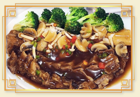
红酒牛勒骨 Briased Beef Rib w. Red Wine