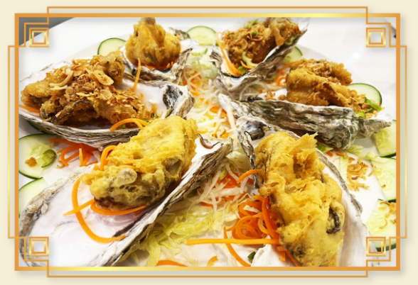
椒鹽生蠔 Deep Fried Oyster w. Salt & Pepper