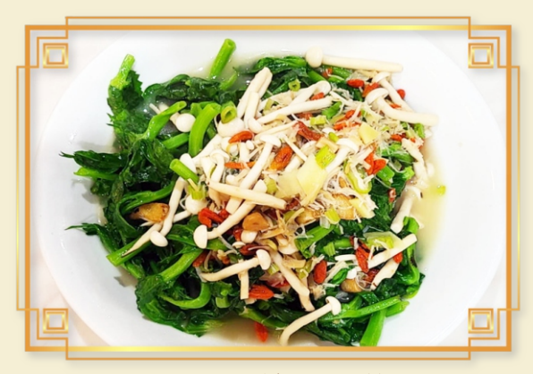
上湯蝦幹浸豆苗 Sautéed Pea Shoots