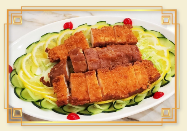
百花釀大腸 Hakka Stuffed Pig Intestine w. Minced Shrimp