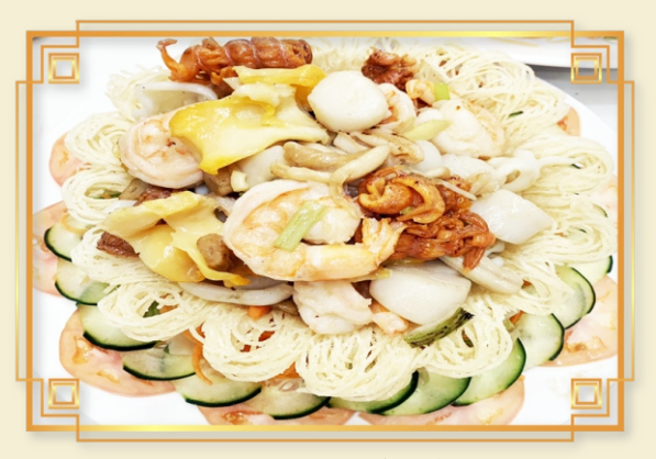
雀巢海中寶 Seafood Delight