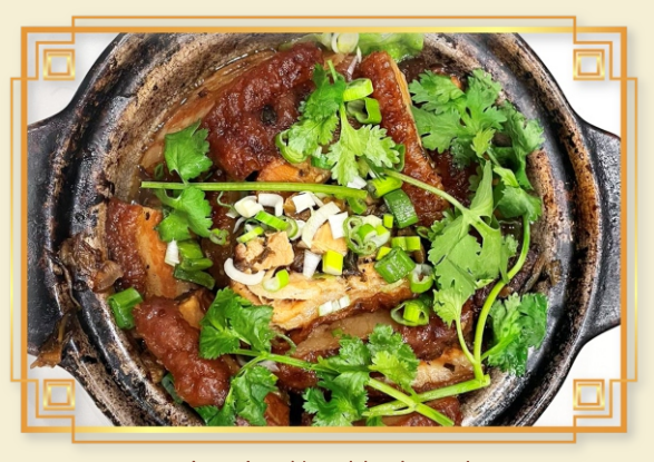
客家梅菜扣肉 Hakka Braised Pork Belly w. Preserved Vegetable