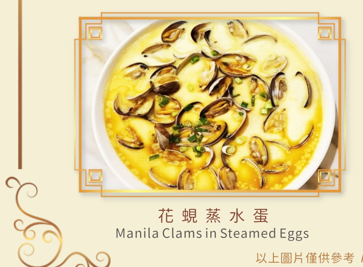
花蜆蒸水蛋 Manila Clams in Steamed Eggs