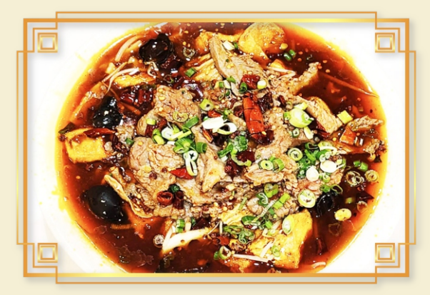
水煮牛肉 Sliced Beefin Sweet & Spicy Sauce