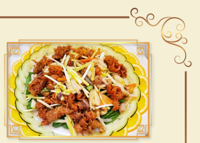
韭 黃 桂 花 蚌 Sautéed Osmanthus Clam w. Yellow Chives