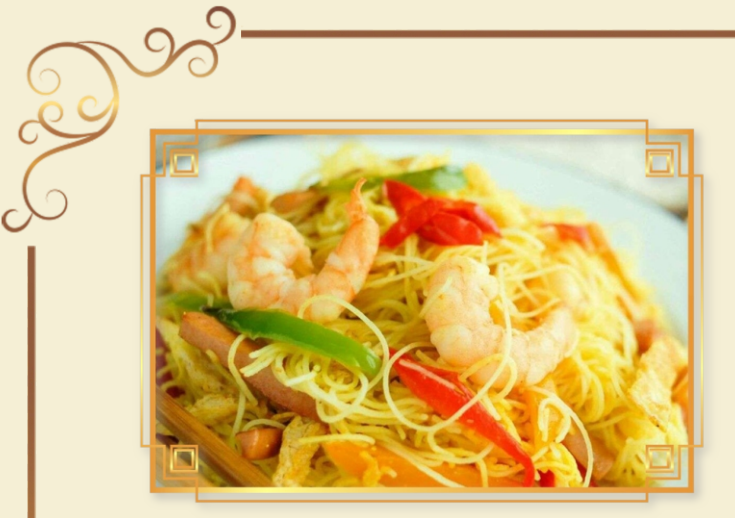
星洲炒米 Singapore Mei Fun