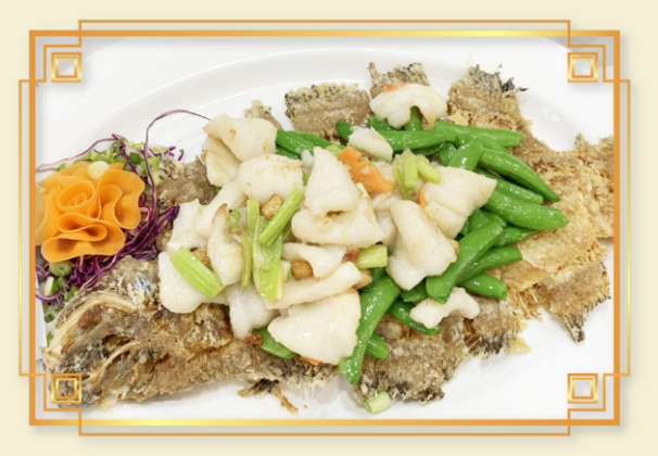
骨香生炒龙利球 Pan-Fried Whole Grey Sole Fish