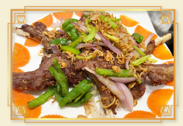
客棧香蔥羊架 Lamb Chops w. Onion