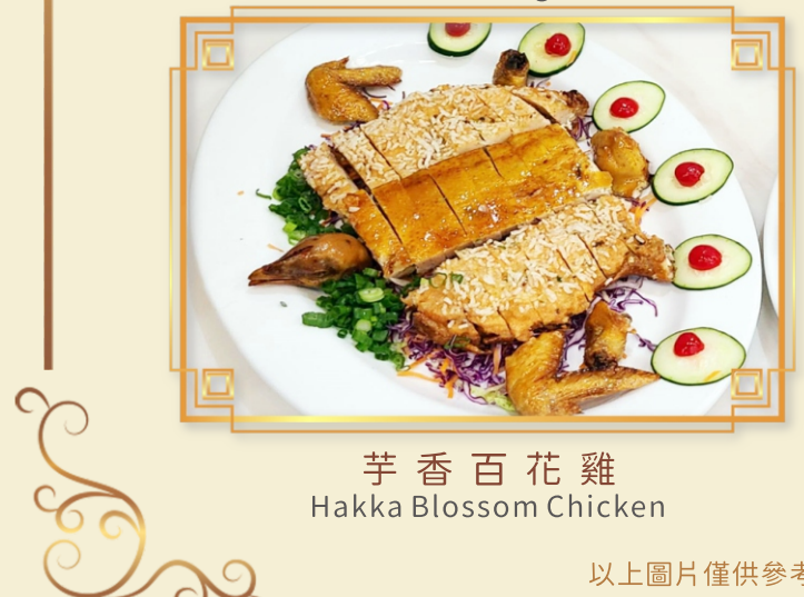
芋香百花雞 Hakka Blossom Chicken