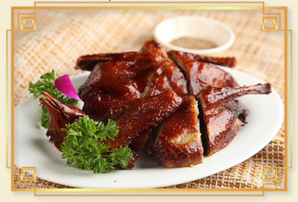
紅燒乳鴿 Crispy Squab