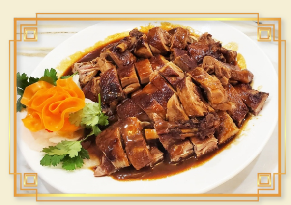
客家碌鴨 Hakka Braised Duck