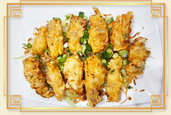
百花让吊片 Stir Fried Silver Fish, Jicama, Squid w. Chives