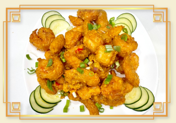
霸皇蝦球 Prawns w. Salted Egg Yolk