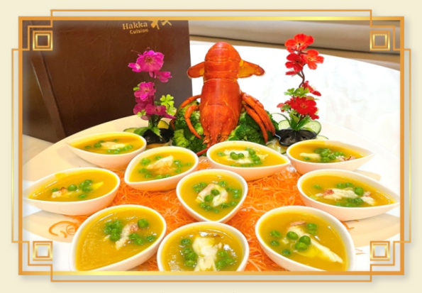
金湯龍蝦 Lobster in Pumpkin Soup