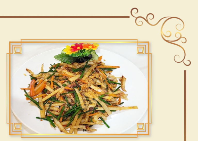
龍鬚銀魚小炒皇 StirFriedSilverFish,Jicama, Squidw.Chives