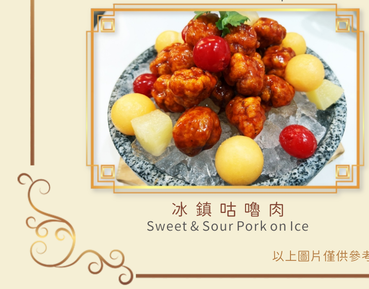
冰鎮咕嚕肉 Sweet & Sour Pork on Ice