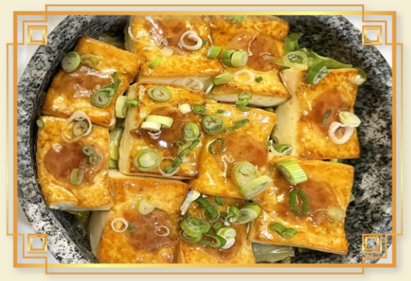
客家釀豆腐 Hakka Stuffed Tofu