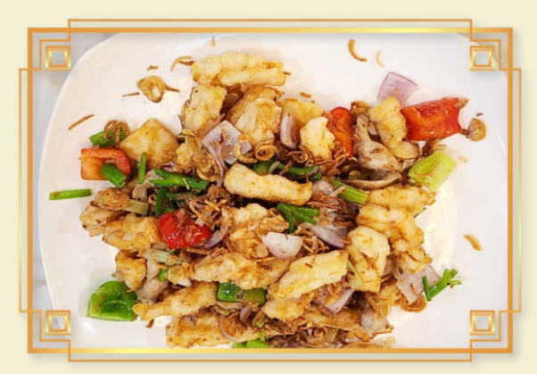
椒盐鲜鱿 Deep Fried Squid w. Salt & Pepper