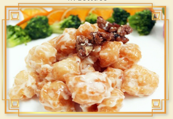
琥珀沙汁蝦球 Prawns w. Honey Walnut in Mayonnaise