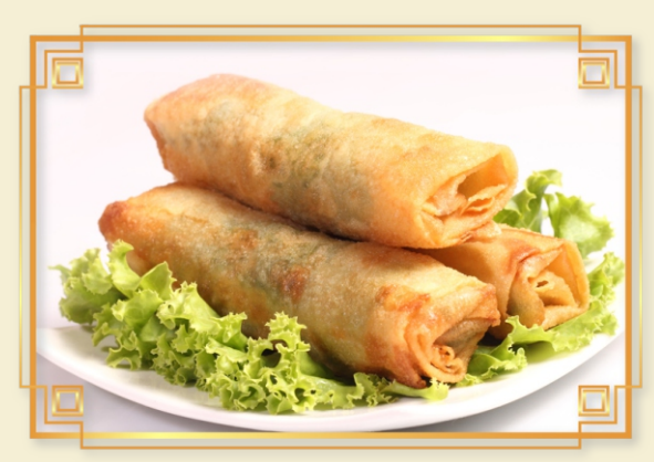
素春卷 Vegetable Spring Rolls