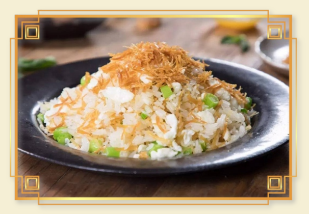
瑤柱蛋白炒飯 Dried Scallops & Egg White Fried Rice